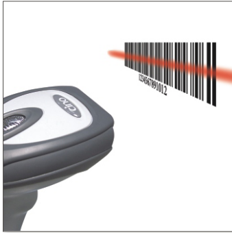
Superb bright aiming line for user visibility