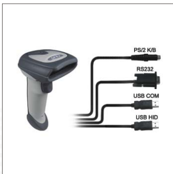
Compatible with most popular hosts by "all-in-one" universal interface