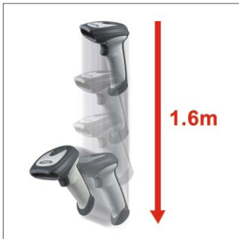
Durable design withstands multiple drops from 1.6 meters