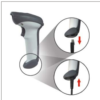
Snap-in, detachable interface cables design link to most popular hosts