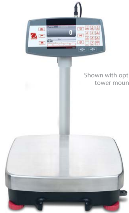
Shown with optional tower mount