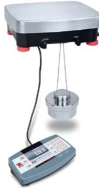
Weight below hook in use

Additionally, a weigh below hook offers the functionality to perform specific gravity tests or weigh items that cannot be easily placed on the weighing platform.