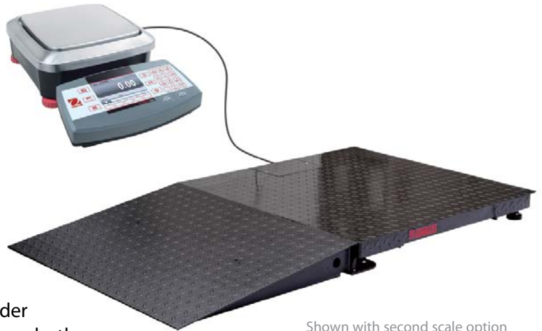
Shown with second scale option

With the 2 nd scale option, you can connect a floor scale platform or bench scale base with higher capacity in order to achieve precise results for a job of any size. Results from both scales can be displayed at the same time. Ranger 7000 can control many peripheral devices through the optional Discrete I/O interface (provides 2 input ports and 4 output ports), allowing for filling control for accurate weight measurement in filling applications.