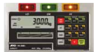
FS-i, water & dust proof

"If you can MEASURE it, You can CONTROL it"