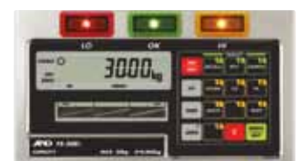
FS-i, water & dust proof

"If you can MEASURE it, You can CONTROL it"