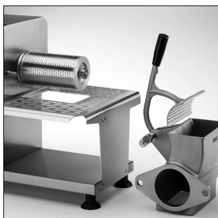
The CEGF2 disassembles for easy cleaning.