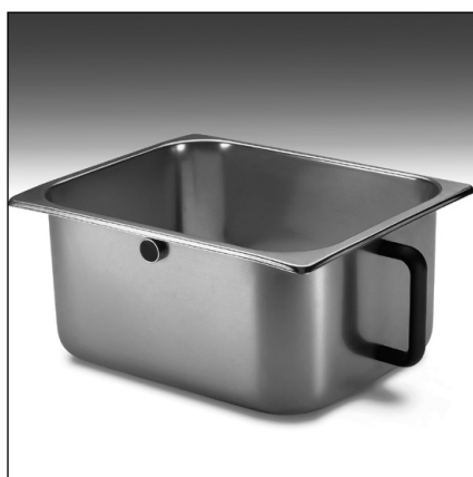
The optional stainless steel container.