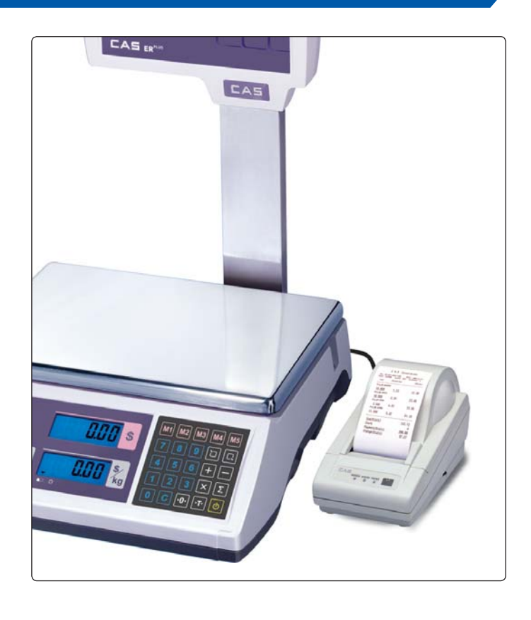
▲ Sample of a Ticket