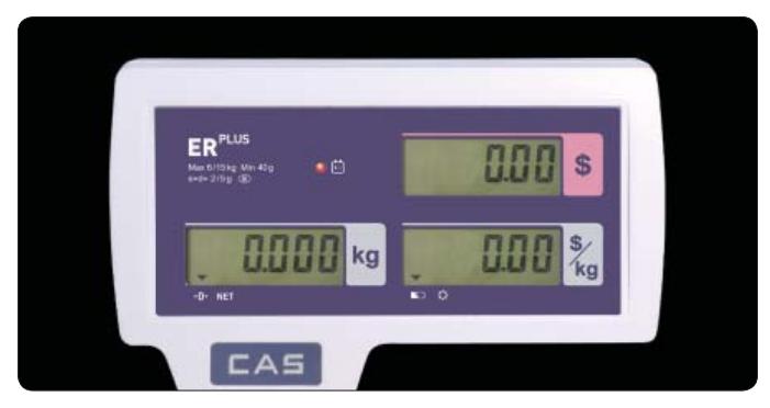
LCD Display A

The ERPLUS comes with an LCD display. Choose between the standard non-pole type or pole type display. The pole type display is reversed so that clients are in full view of price and weight.