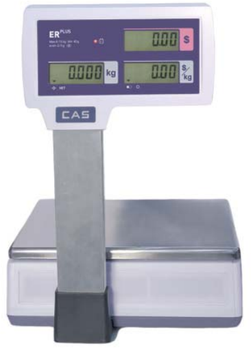
▲ Client view pole display