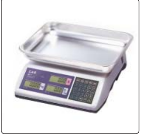
▲ Fish Tray