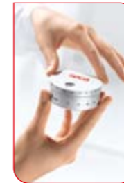
The WHR (Waist-To-Hip) scale determines fat distribution.

Ergonomic circumference measuring tape with extra Waist-To-Hip-Ratio (WHR)