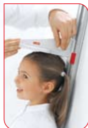
The graduation index can be fixed in place with the locking screw.