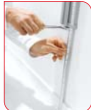
Whether for children or adults – the measuring range can be adjusted as needed.