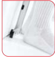
The foot positioner ensures exact positioning and precise measurements.