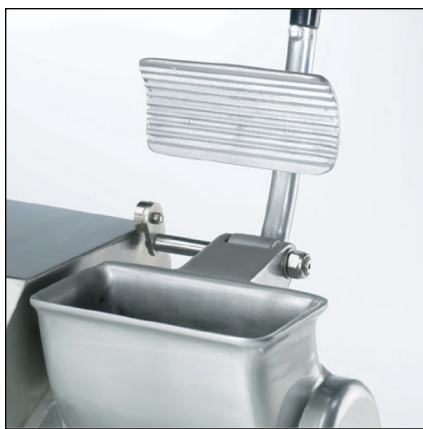
The the large inlet makes handling large food pieces a breeze.