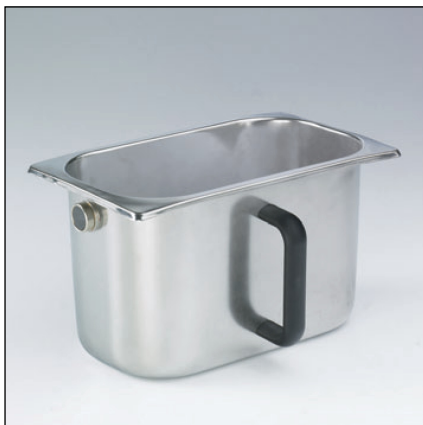
The optional stainless steel container.