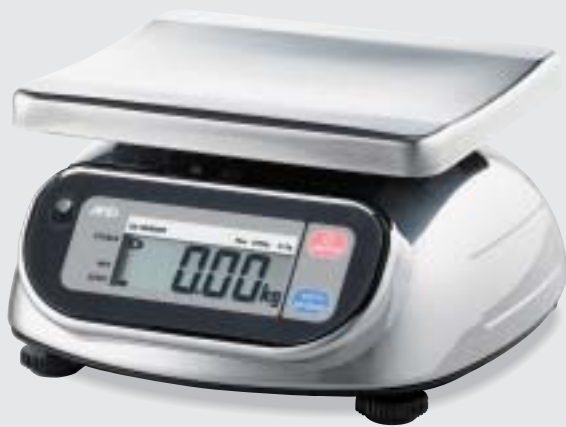
Model Capacity & Resolution