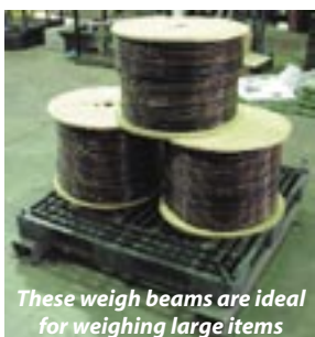
These weigh beams are ideal for weighing large items