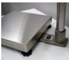
■ Low profile base design