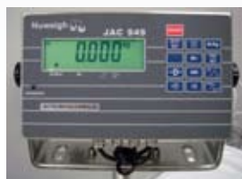
■ Large 26mm LCD display