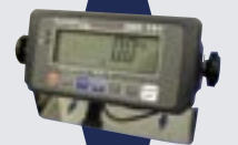
Connection to any scale or loadcell