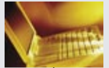
RS 232 output to computer