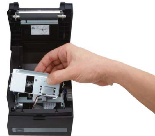
Easy Maintenance for Cutter, Print Head and Platen