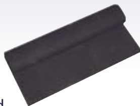
Non-Slip Rubber Mat