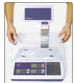
▲ Dust Protection Cover