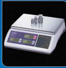
Dual interval technology