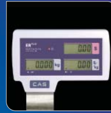
Client view pole display