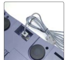
▲ RS-232C Interface