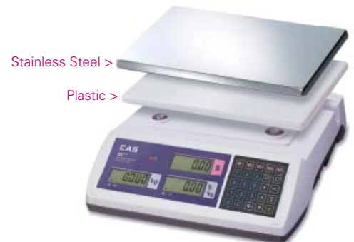
Stainless Steel >

Designed with both plastic and stainless steel trays that are made from heavy-duty and washable materials.