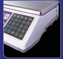
Soft touch key pad