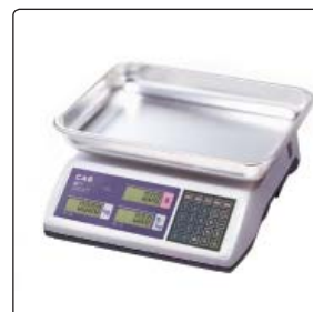
▲ Fish Tray