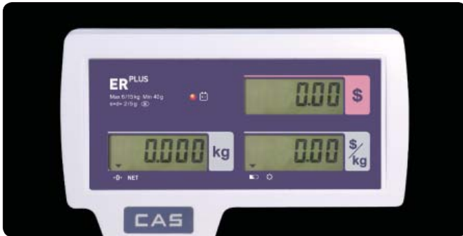
LCD Display ▲

The ER PLUS comes with an LCD display. Choose between the standard non-pole type or pole type display. The pole type display is reversed so that clients are in full view of price and weight.