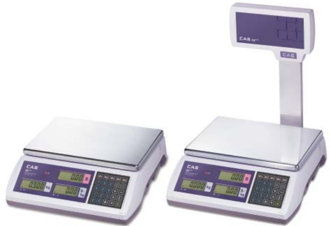
Standard Type ▲