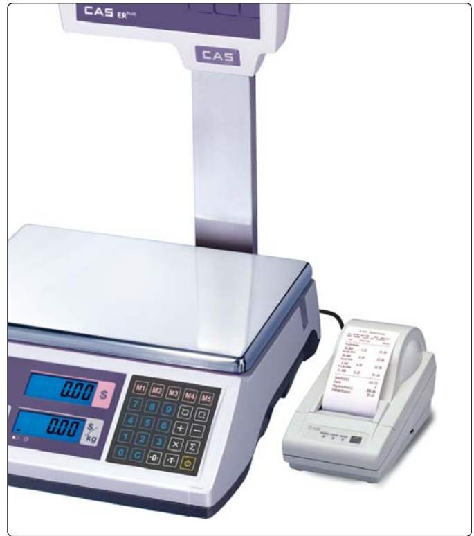
▲ Sample of a Ticket