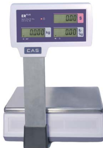
▲ Client view pole display